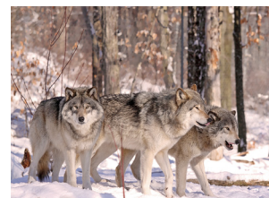
Appropriate wolf pack management and tracking. More resources for ranchers impacted by wolf packs.