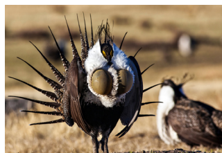
Working with biologists on endangered species protection for Sage Grouse in Eastern Oregon.