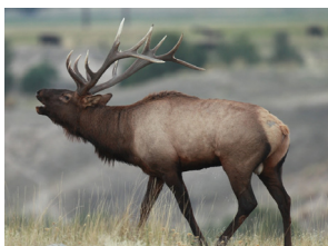
Elk population and damage control.

Oregon's ranchers are the original conservationists! We aim to ensure Oregon's wildlife is appropriately managed to achieve healthy habitats and ecosystems while protecting the rights and needs of our producers.