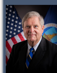
Thomas J Vilsack is the 32nd United States Secretary of Agriculture.

9:30 - 11:00 Hospitality Suite Open at Oxford Suites